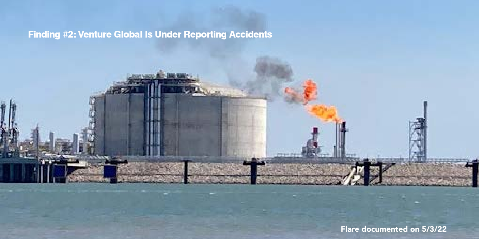
Flare documented on 5/3/22