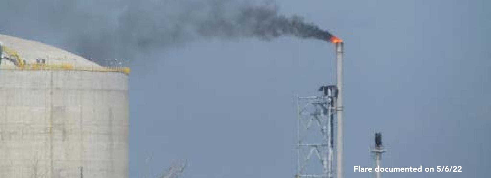
Flare documented on 5/6/22