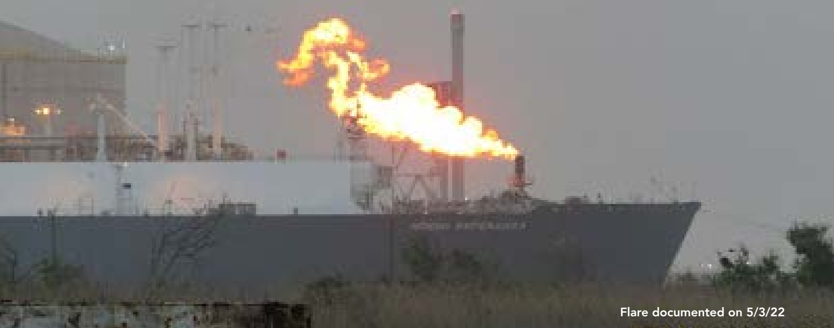
Flare documented on 5/3/22

Start of gas export production: Jan 19, 2022