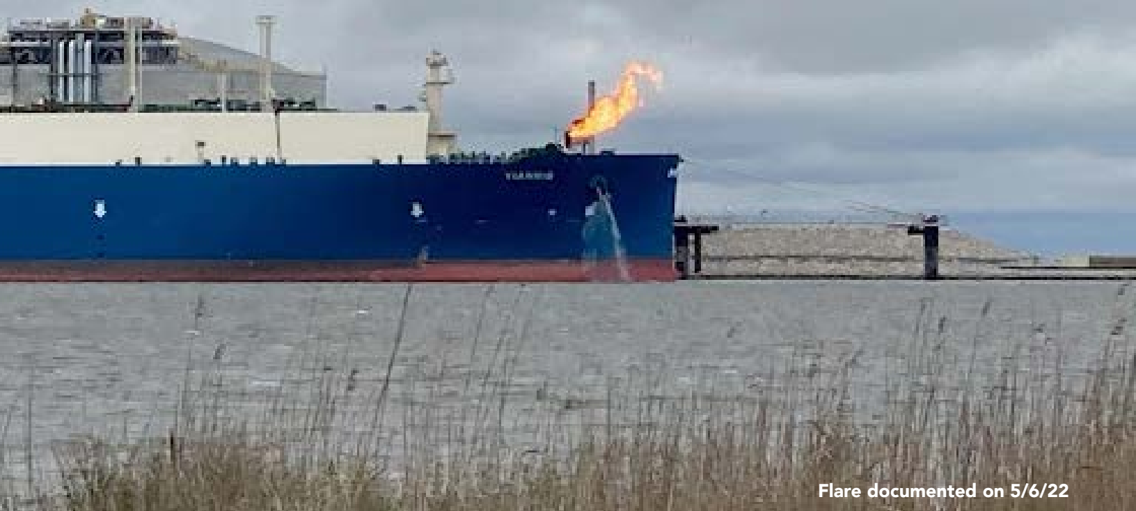
Table I: Accident reports + flare documentation at CP (continued)